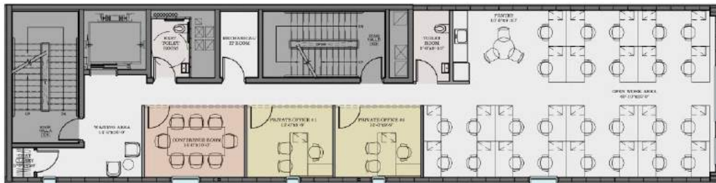
TEST FIT 2