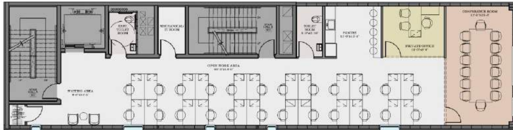
TEST FIT 3